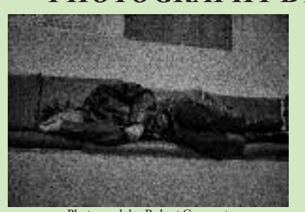
"I need some deodorant. My skin's getting

restless." Psychiatric Emergency Services (PES)