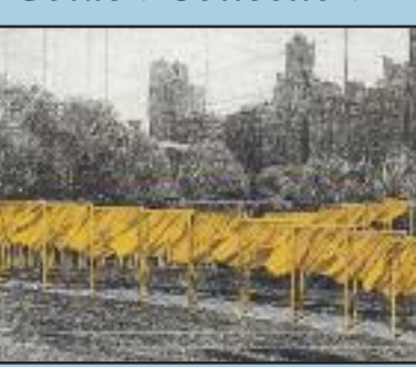
The collection includes original drawings, sculptures, collages and

An extraordinary traveling exhibition of a unique collection of works of art by renowned artists Christo and Jeanne-Claude will visit the Saint Mary's College Museum of Art.